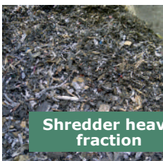
Shredder heavy fraction