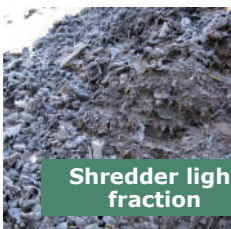
Shredder light fraction